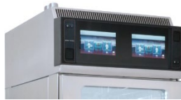
Available without integrated hood as FSD 610/610